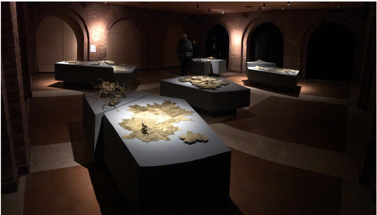
Naiza Khan, Hundreds of Birds Killed (installation shot), Soundscape with brass installation, 2020

Recent, Current and Forthcoming Projects 2020